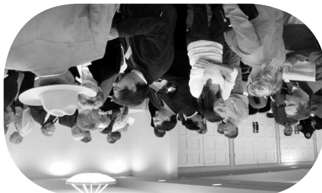
Desert Tortoise Preserve Committee 35th Annual General Meeting and Banquet

THE DESERT TORTOISE PRESERVE COMMITTEE INVITES YOU TO ATTEND OUR FALL WORK PARTY!!