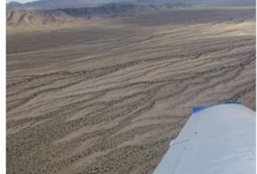
Looking southeast across DTPC parcels in Amy's Wash area

For additional photos, please see the photo album on the DTPC Facebook page ( http://www.facebook.com/DTPCInc ).