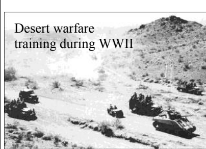
Desert warfare training during WWII

The California Deserts have seen military activity for over 200 years. Within the approximately 25 million acres of California Desert, there are six active military installations and at least 50 formerly used defense sites and closed military stations. Throughout these areas, one can encounter unexploded ordnance (UXO), munitions such as bombs, shells, grenades, land mines, and artillery projectiles that did not explode when planted or fired, but still pose the risk of detonation. Much of these UXO are left over from the extensive military training that took place during World