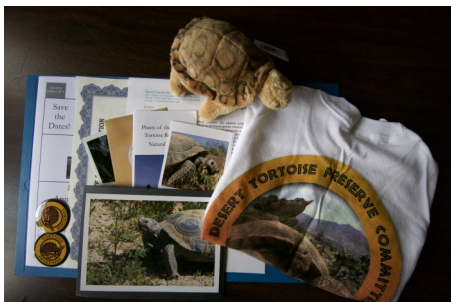
Pictured above is an example of our Gold level adoption kit.

We have updated our symbolic adoption kits to reflect different levels of giving. All of our symbolic adoption kits include an annual subscription to our newsletter Tortoise Tracks , a 5 x7 photograph, personalized certificate, and informational materials. Depending on the level of giving you choose you will also receive a plush tortoise, t-shirt, or both! We have also included a family option for those who may have more than one person they would like to include in their symbolic adoption. These kits are currently available in our shop on our website at www.tortoise-tracks.org