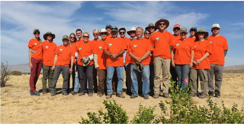
Volunteers after a long day of work. Not all attendees are pictured.